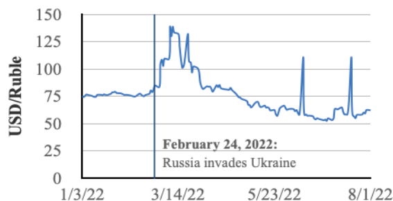
Figure 2. Time-series of USD/Ruble exchange rate after the Russian invasion of Ukraine.