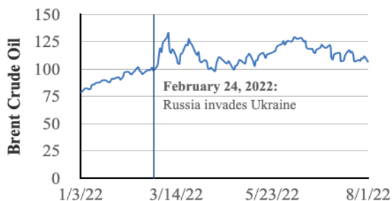
Figure 1. Time-series of Brent Crude Oil prices after the Russian invasion of Ukraine.

Following the invasion of Ukraine, shockwaves were sent throughout global financial markets. An orchestrated response of severe economic sanctions against Russia significantly limited the country's access to capital markets. Subsequently, as shown in Figures 1 and 2, Brent